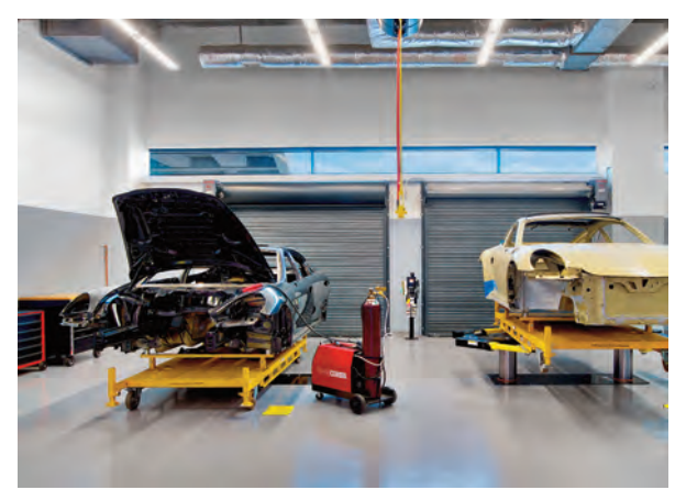
Stonclad GR floor in the training center.

The Stonhard Group provided PCNA with a unique installation of the Crush flooring system, complete with a custom aggregate troweled at a thickness of 3/16". The floor surface is a very large portion of the PCNA facility, which makes this exclusive look an integral part of the bold, state-of-the-art design of the space.